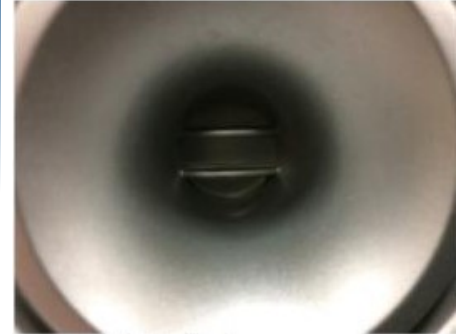
WHAT IS THIS?

Reminder: send your guesses to the Blue Ink on snapchat or via twitter for your chance at a candy bar.