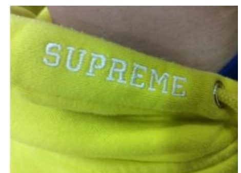
WHO IS THIS?