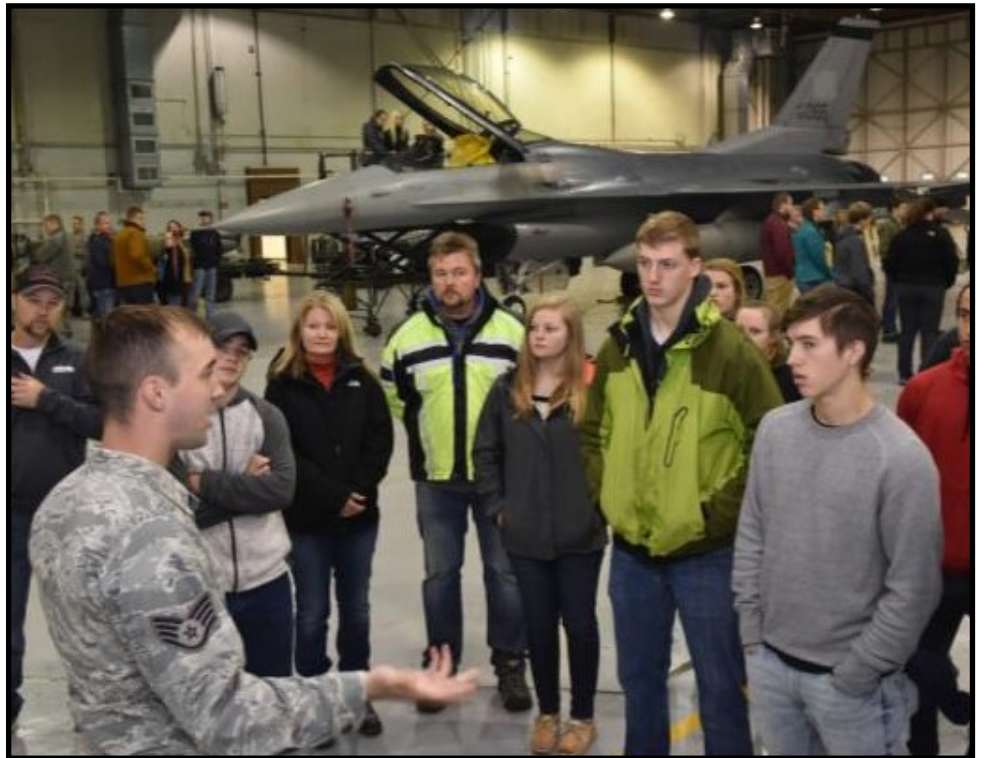
A staff sergeant and technician explains to career day attendees about the functions of the Mobile Emergency Operation Center and the benefits of his career with the 114th Fighter Wing. The career day exposed high school and college aged students to the wide variety of careers the Air National Guard has to offer.

Lastly, the potential recruits and their families were taken to a fence right outside of a runway to watch the launching of eight F-16 aircraft. How many