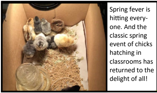
Spring fever is hitting everyone. And the classic spring event of chicks hatching in classrooms has returned to the delight of all!